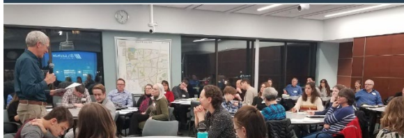
1/22/20 Hennepin Cities Climate Action Conversation in SLP