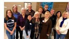
Minnetonka Climate Initiative