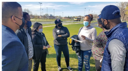
April MN BIPOC Local Elected Network meeting in Brooklyn Center