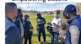
MN BIPOC Local Electeds